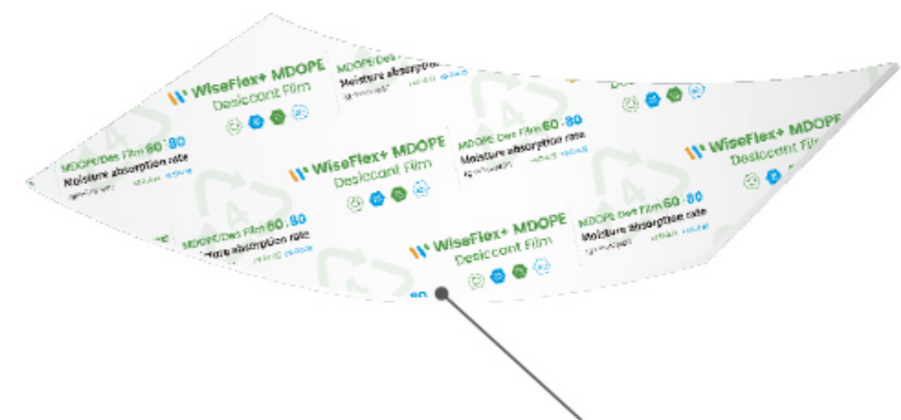
After absorb moisture, color changes from milky white to translucent with MS Desiccant film

If by using MS based desiccant film, after absorbing moisture, its color changes from milky white to translucent, allowing for easy monitoring moisture-absorbing status. This recyclable desiccant film is suitable for packaging a variety of moisture-sensitive products, such as pills and powdered health supplements.