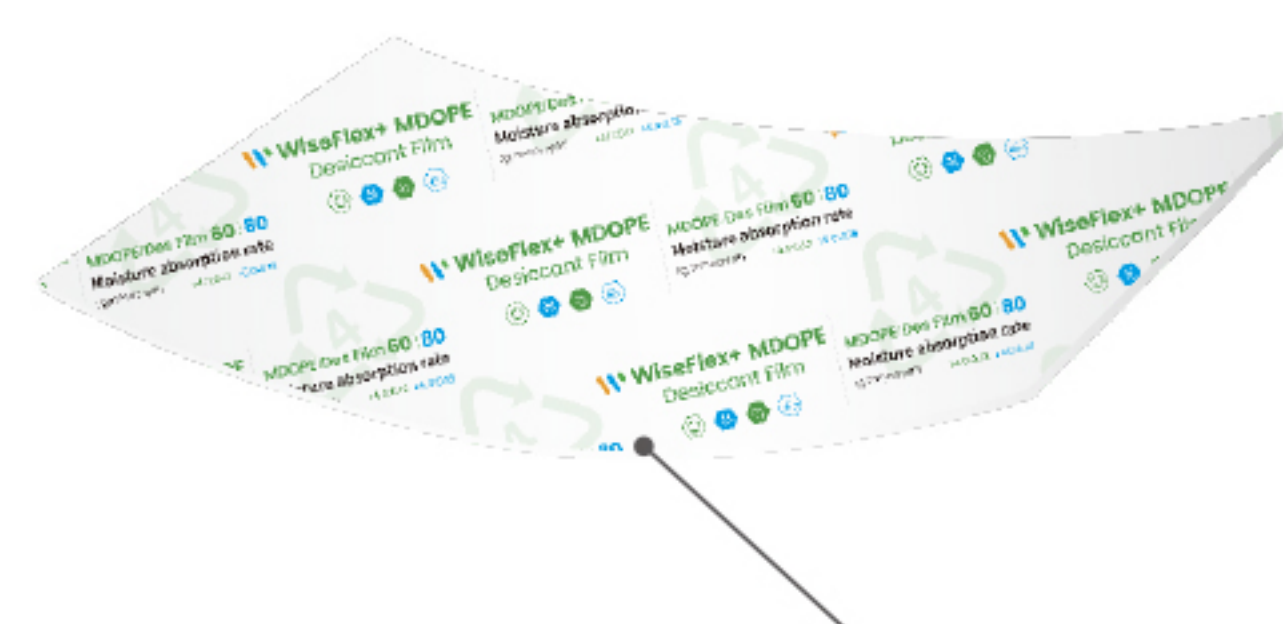
After absorb moisture, color changes from milky white to translucent.

As the desiccant film absorbs moisture, its color changes from milky white to translucent, allowing for easy monitoring of its moisture-absorbing status. This recyclable desiccant film is suitable for packaging a variety of moisture-sensitive products, such as pills and powdered health supplements.