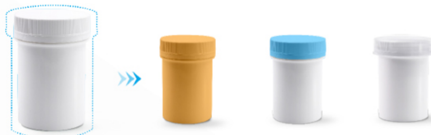
*Tube cap and body colors are customizable.