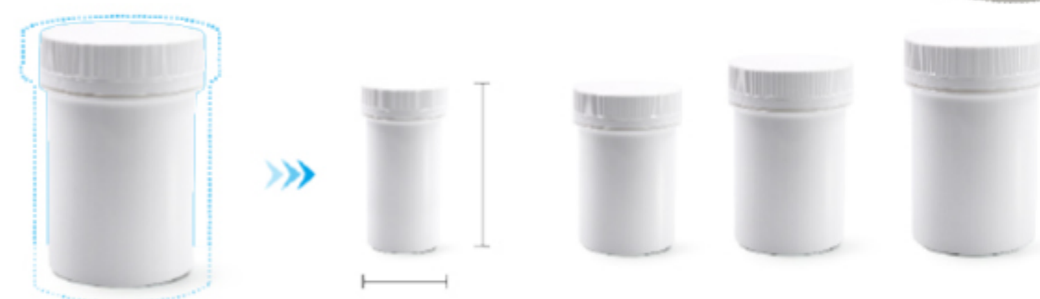
*Tube size and design are also customizable.