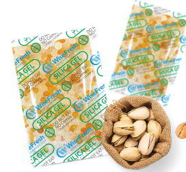
SILICA GEL DESICCANT

11 E Stow Rd, Marlton, NJ 08053, USA info@wisesorbent.com