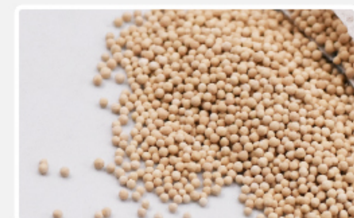
• Molecular sieve